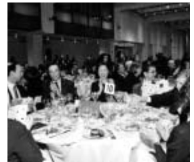
Guests from Weil, Gotshal & Manges enjoy dinner and the revelry of the evening.